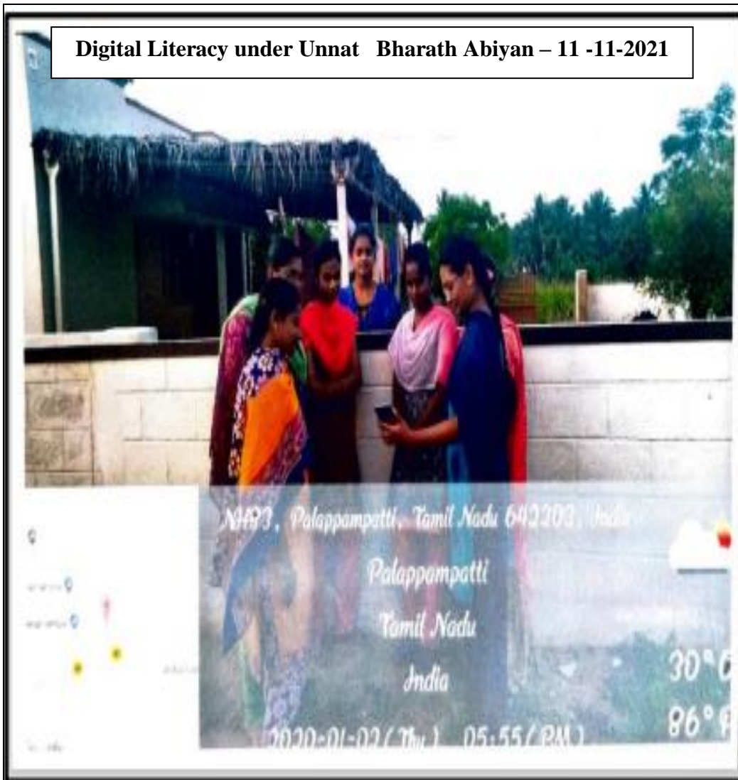
Digital Literacy under Unnat Bharath Abiyan – 11-11-2021